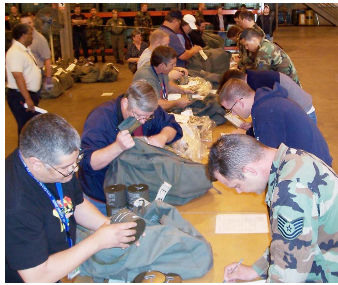
507th ARW members help base Supply inventory our mobility bags in preparing for the upcoming ORI. Making sure the bags are ready to get the unit out of town is an important part of the grade before we arrive at the deployment location.